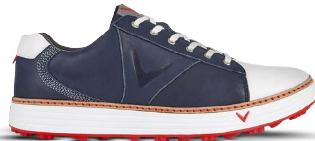
M559-06 NAVY / WHITE

1-Year Limited Waterproof Warranty 30-Day Comfort Guarantee