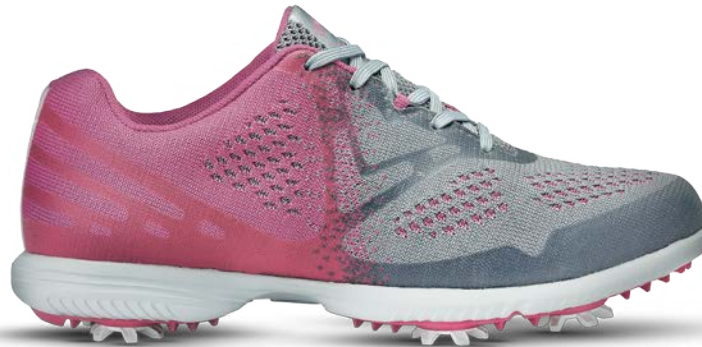
W630-12 PINK / GREY

An incredibly lightweight Tour performance shoe that is waterproof and breathable.