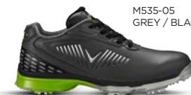
M535-05 GREY / BLACK / GREEN