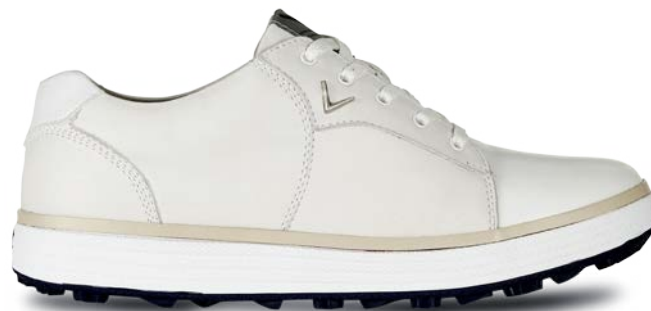
W610-27 PUTTY / WHITE

Sumptuous leather, brilliantly comfortable with drop-in footbed technology and fashionable retro good looks mean the Ozone is a sure head turner.