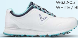
W632-05 WHITE / BLUE