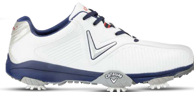
M541-15 WHITE / PEACOCK

1-Year Limited Waterproof Warranty 30-Day Comfort Guarantee