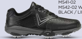
M541-02 M542-02 WIDE BLACK / LIME