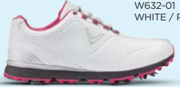
W632-01 WHITE / PINK