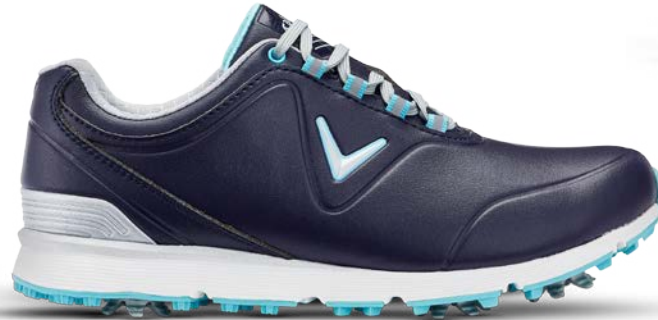
W632-10 PEACOCK / BLUE