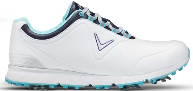
W632-05 WHITE / BLUE

1-Year Limited Waterproof Warranty 30-Day Comfort Guarantee