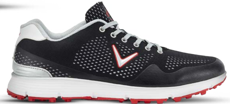
M540-02 BLACK / WHITE