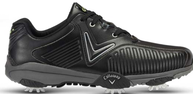
M541-02 M542-02 WIDE BLACK / LIME