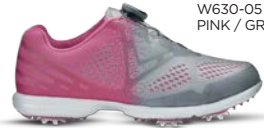
W630-05 PINK / GREY