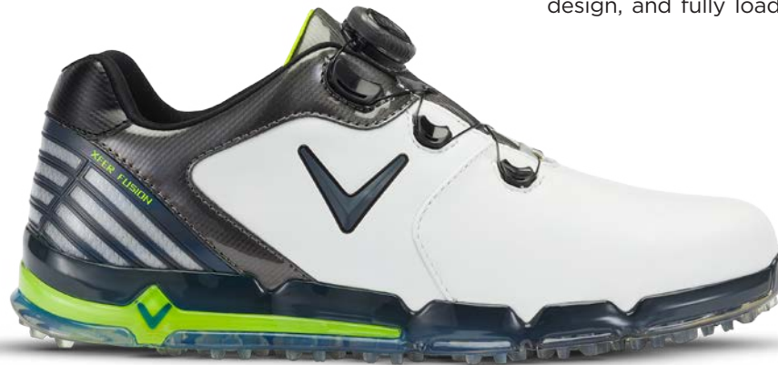
M532-01 WHITE / GREY / GREEN

The BOA version of the Xfer™ Fusion is the ultimate in modern permanent traction technology. A Tour performance piece of equipment combining the worlds first TPU hybrid outsole with sumptuous full grain leather, eyecatching design, and fully loaded Xfer™ performance Tour technology.