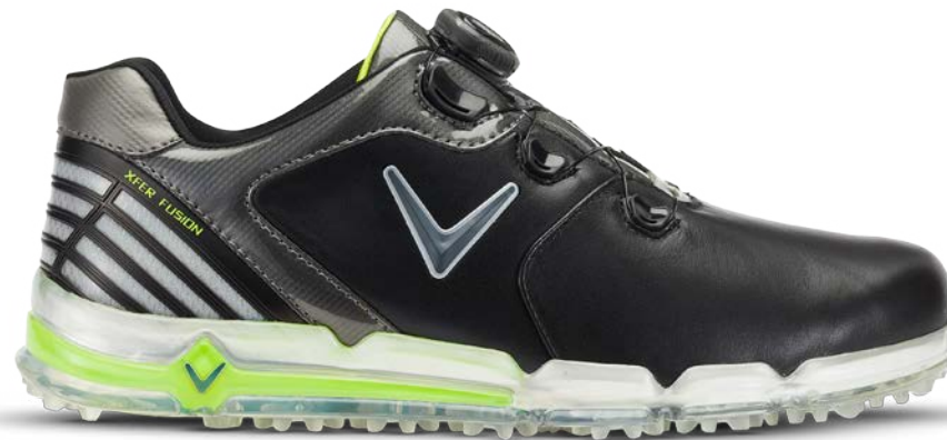
M532-02 BLACK / GREY / GREEN

1-Year Limited Waterproof Warranty 30-Day Comfort Guarantee