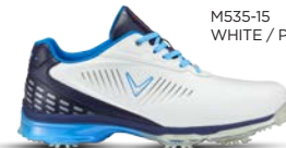
M535-15 WHITE / PEACOCK