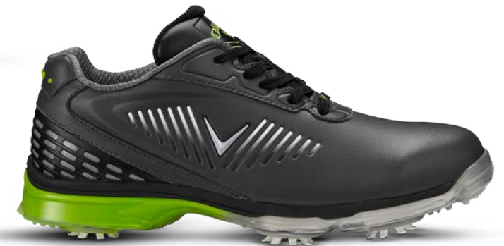
M535-05 GREY / BLACK / GREEN

1-Year Limited Waterproof Warranty 30-Day Comfort Guarantee