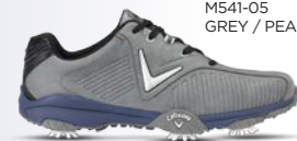
M541-05 GREY / PEACOCK