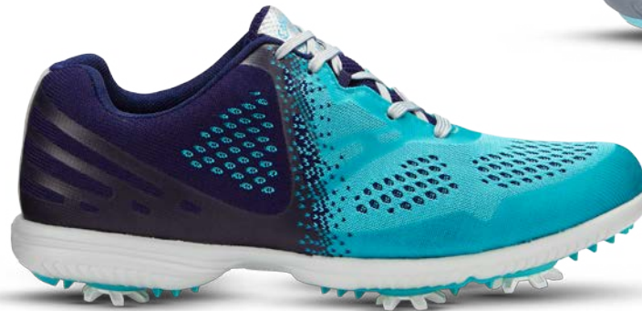
W631-10 BLUE / SILVER

1-Year Limited Waterproof Warranty 30-Day Comfort Guarantee