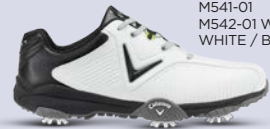
M541-01 M542-01 WIDE WHITE / BLACK