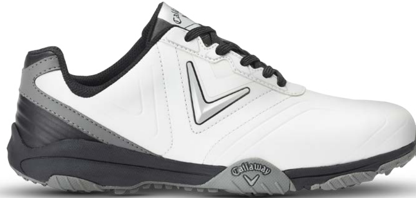
M543-01 WHITE / BLACK

Leather, waterproof and guaranteed comfort straight out of the box. A core Chev product that won't let you down.