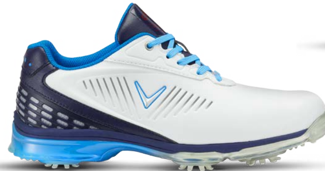
M535-15 WHITE / PEACOCK