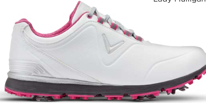
W632-01 WHITE / PINK

Beautifully styled and athletically inspired, the waterproof and cleated Lady Mulligan is due to be an industry winner just like her big brother.