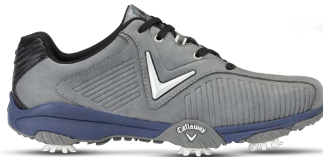
M541-05 GREY / PEACOCK