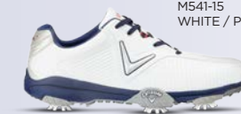
M541-15 WHITE / PEACOCK