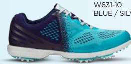
W631-10 BLUE / SILVER