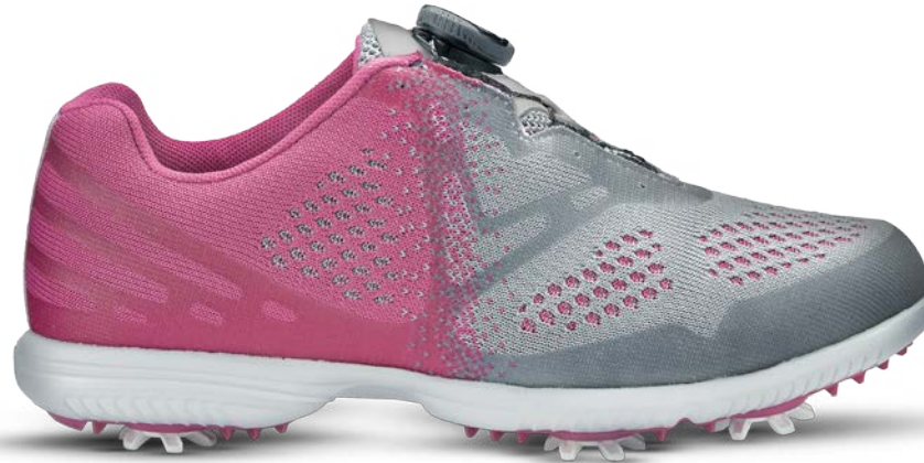
W630-05 PINK / GREY

The BOA version of the Halo Tour, combines BOA technology with an incredibly lightweight Tour performance cleated shoe that is waterproof and breathable.