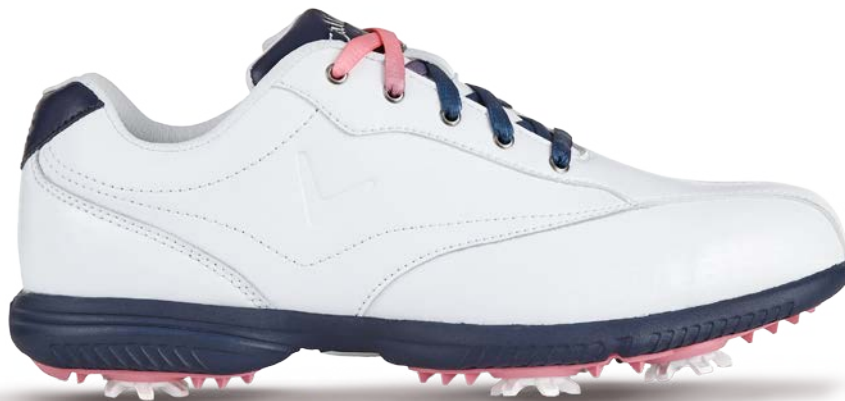
W448-26 WHITE / PEACOCK

A perfect combination of leather, waterproofing and cleated performance, this is a must have stylish ladies golf shoe.