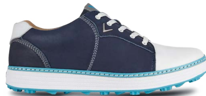
W610-06 NAVY / WHITE

1-Year Limited Waterproof Warranty 30-Day Comfort Guarantee