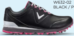
W632-02 BLACK / PINK