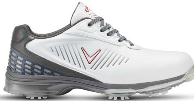
M535-01 WHITE / GREY / CRIMSON

A head turning contemporary design that's fully loaded with technology and built for Tour.