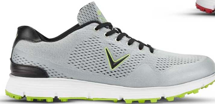
M540-05 GREY / LIME