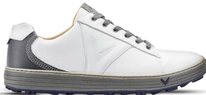
M538-10 WHITE / CHARCOAL

Sumptuous leather, comfort technology and fashionable retro looks mean the Delmar Retro is now an industry superstar!