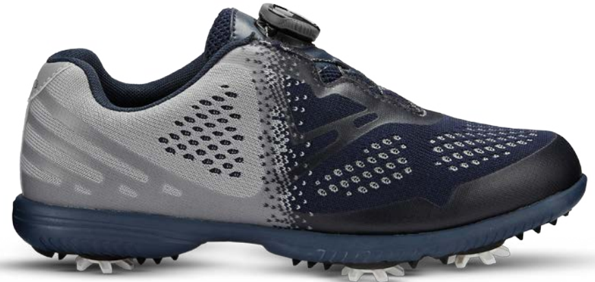
W630-10 SILVER / PEACOCK

1-Year Limited Waterproof Warranty 30-Day Comfort Guarantee