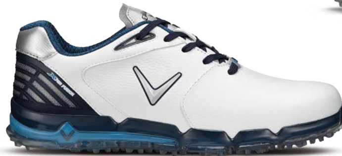
M534-15 WHITE / PEACOAT

1-Year Limited Waterproof Warranty 30-Day Comfort Guarantee