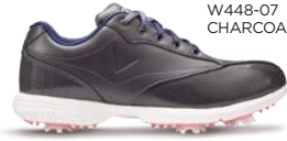
W448-07 CHARCOAL / WHITE