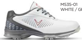
M535-01 WHITE / GREY / CRIMSON