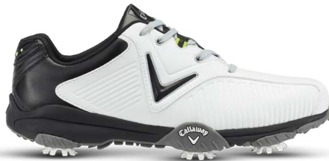
M541-01 M542-01 WIDE WHITE / BLACK

The new leather version of Chev Mulligan is fantastically lightweight, waterproof and will perform for 18 holes straight out of the box.