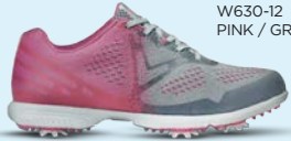
W630-12 PINK / GREY