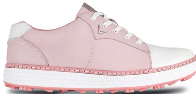
W610-80 PINK / WHITE