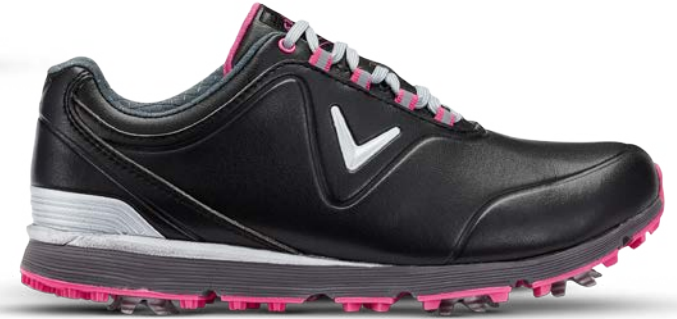
W632-02 BLACK / PINK