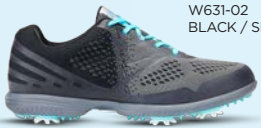
W631-02 BLACK / SILVER