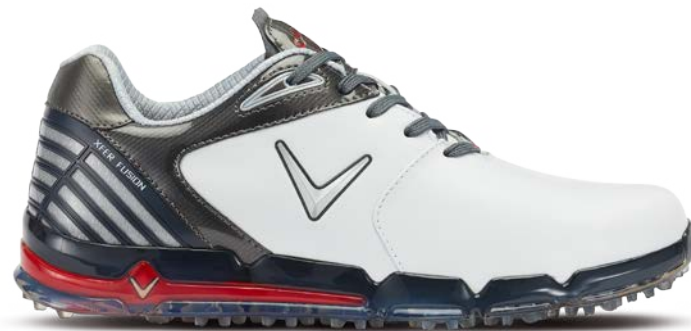
M534-01 WHITE / GREY / CRIMSON

Tour performance equipment combining the worlds first TPU hybrid outsole with sumptuous full grain leather, eyecatching design and fully loaded Xfer™ performance Tour technology.