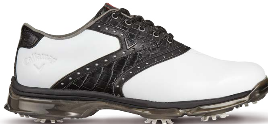
M557-12 WHITE / BLACK

Sure to be a core line winner, the plain toe classic upper sits on our Tour proven TPU outsole and is powered by Big Bertha® power cleats.