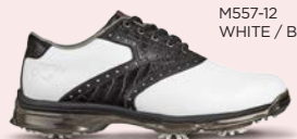
M557-12 WHITE / BLACK