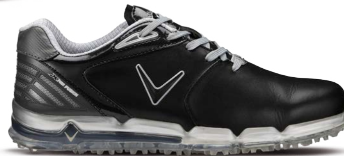
M534-02 BLACK / GREY