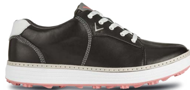
W610-02 BLACK / GERANIUM