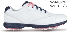
W448-26 WHITE / PEACOCK