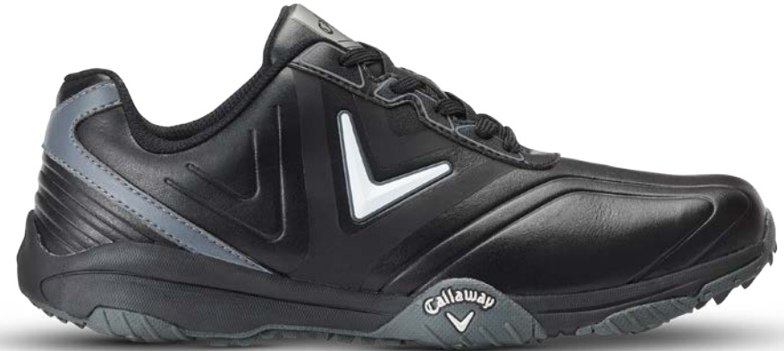
M543-02 BLACK / SILVER

1-Year Limited Waterproof Warranty 30-Day Comfort Guarantee