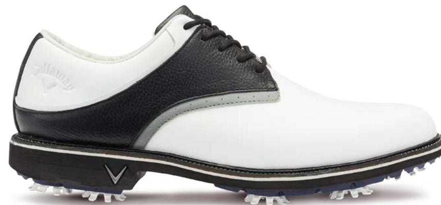
M537-01 WHITE / BLACK

1-Year Limited Waterproof Warranty 30-Day Comfort Guarantee