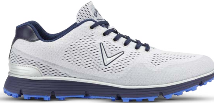
M540-01 WHITE / PEACOCK

“Air conditioning for your feet”. The ideal summer shoe that is lightweight, cool and comfortable, yet with enough protection against the early morning dew.