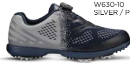
W630-10 SILVER / PEACOCK