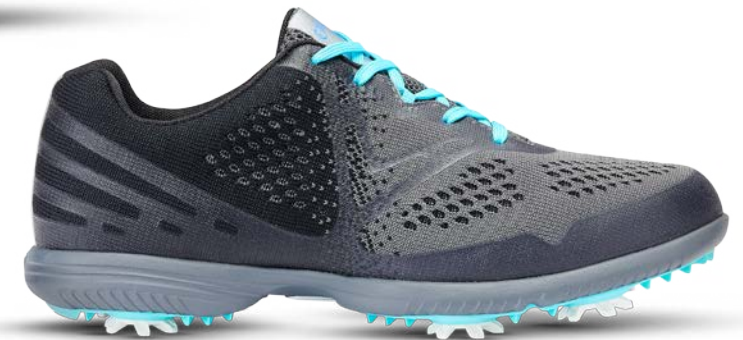
W631-02 BLACK / SILVER