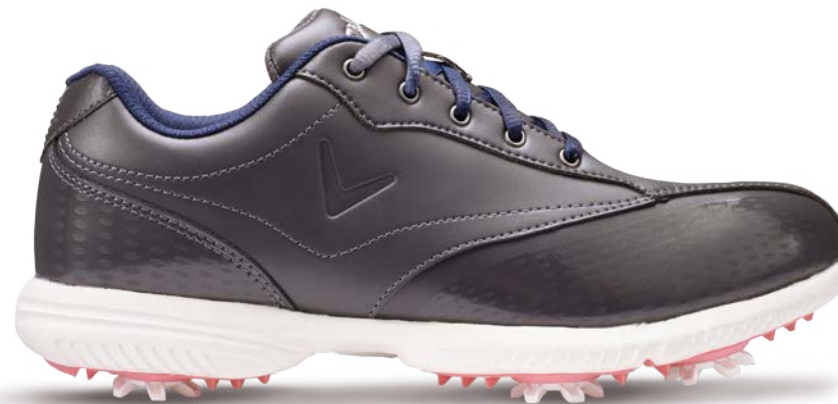
W448-07 CHARCOAL / WHITE

1-Year Limited Waterproof Warranty 30-Day Comfort Guarantee