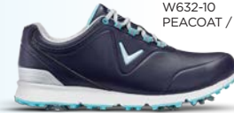
W632-10 PEACOCK / BLUE